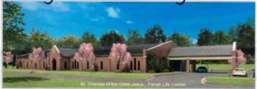
St. Theresa of the Child Jesus - Parish Life Center