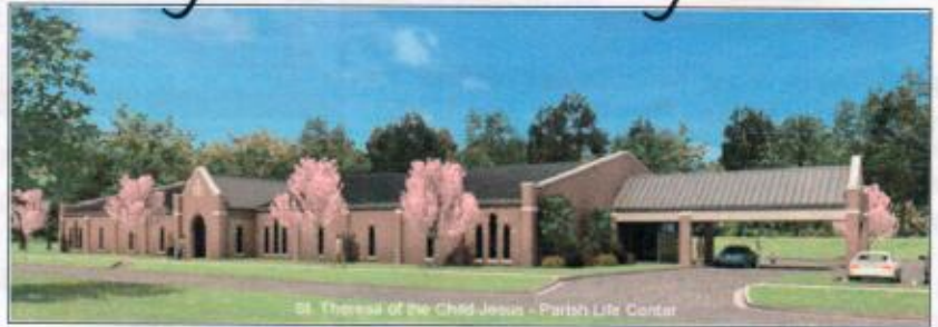
St. Theresa of the Child Jesus - Parish Life Center