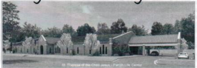
St. Theresa of the Child Jesus - Parish Life Center