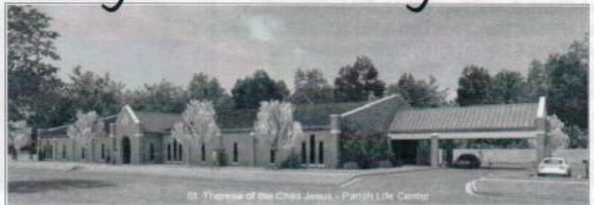
St. Theresa of the Child Jesus - Parish Life Center