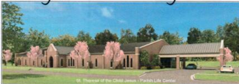
St. Theresa of the Child Jesus - Parish Life Center