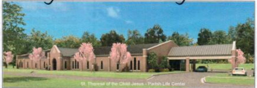
St. Theresa of the Child Jesus - Parish Life Center