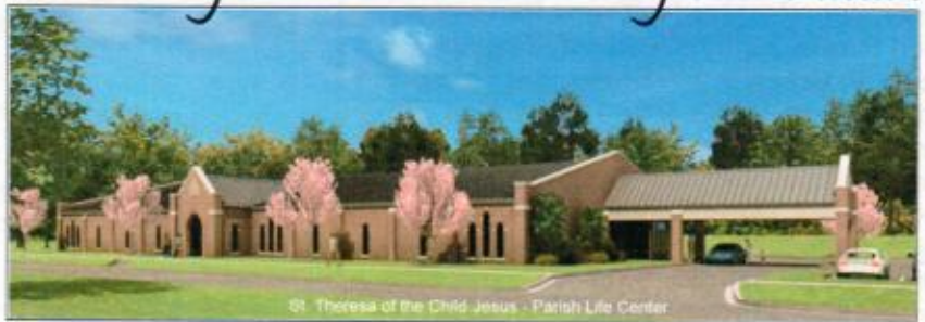
St. Theresa of the Child Jesus - Parish Life Center