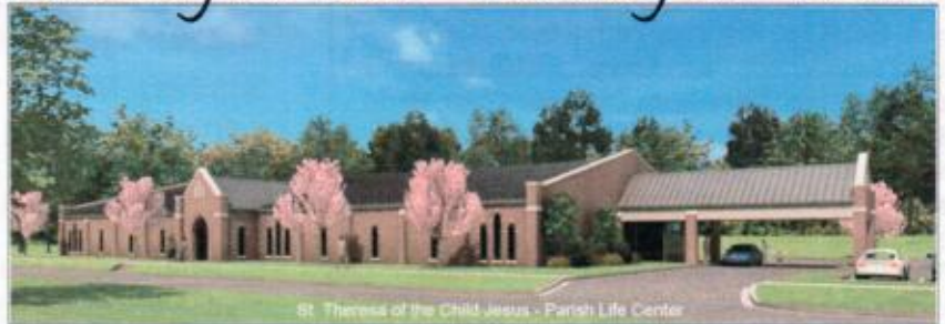
St. Theresa of the Child Jesus - Parish Life Center