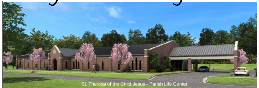
St. Theresa of the Child Jesus - Parish Life Center

Pledges Received: $629,509 – 63% of our goal