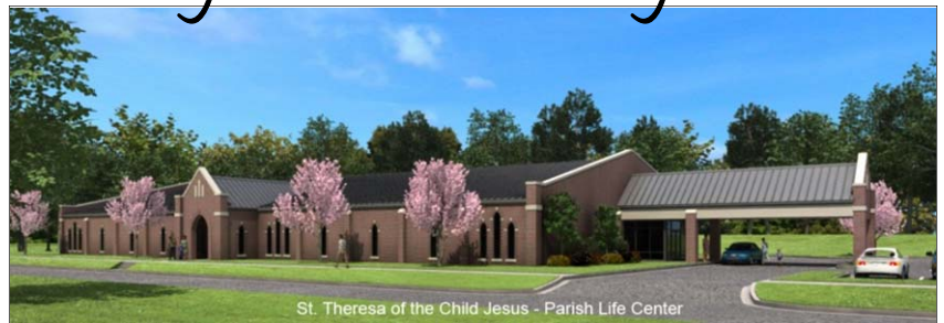
St. Theresa of the Child Jesus - Parish Life Center