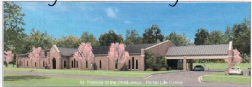
St. Theresa of the Child Jesus - Parish Life Center

Pledges Received: $641,827 – 64% of our goal