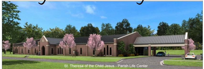
St. Theresa of the Child Jesus - Parish Life Center