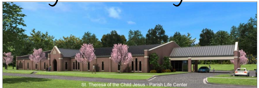
St. Theresa of the Child Jesus - Parish Life Center