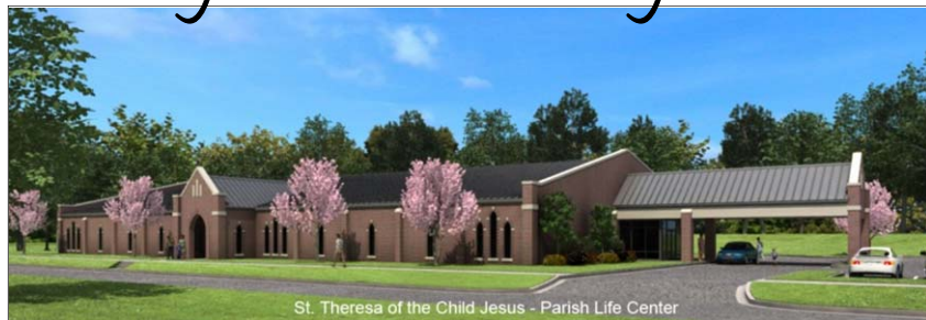
St. Theresa of the Child Jesus - Parish Life Center