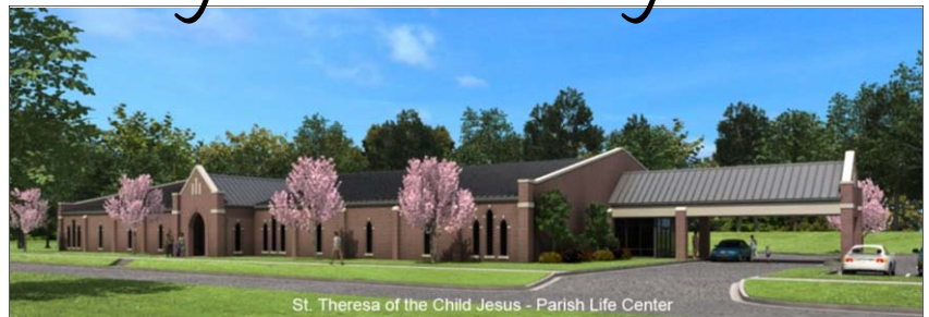
St. Theresa of the Child Jesus - Parish Life Center